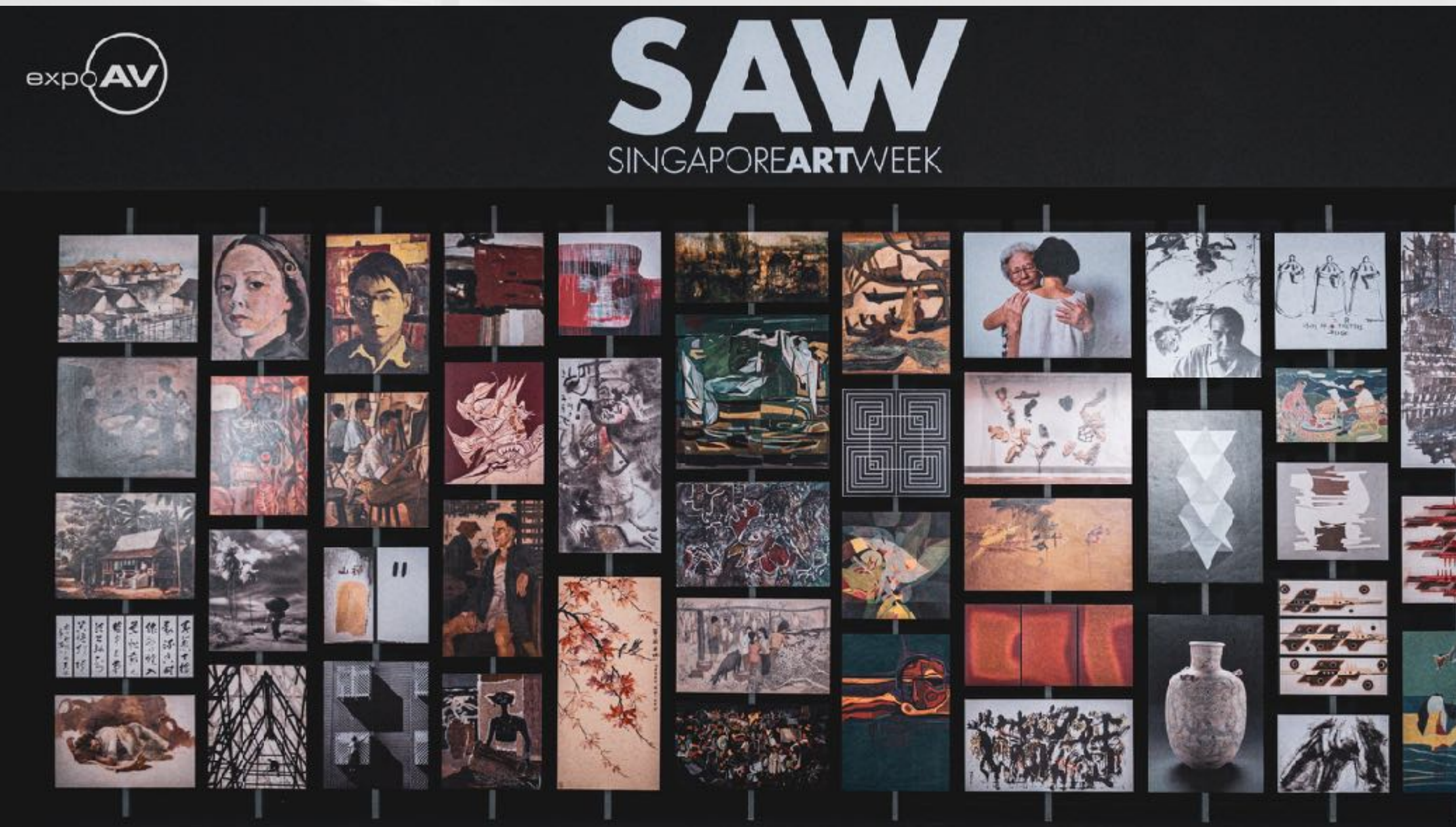
Click to shuffle through images