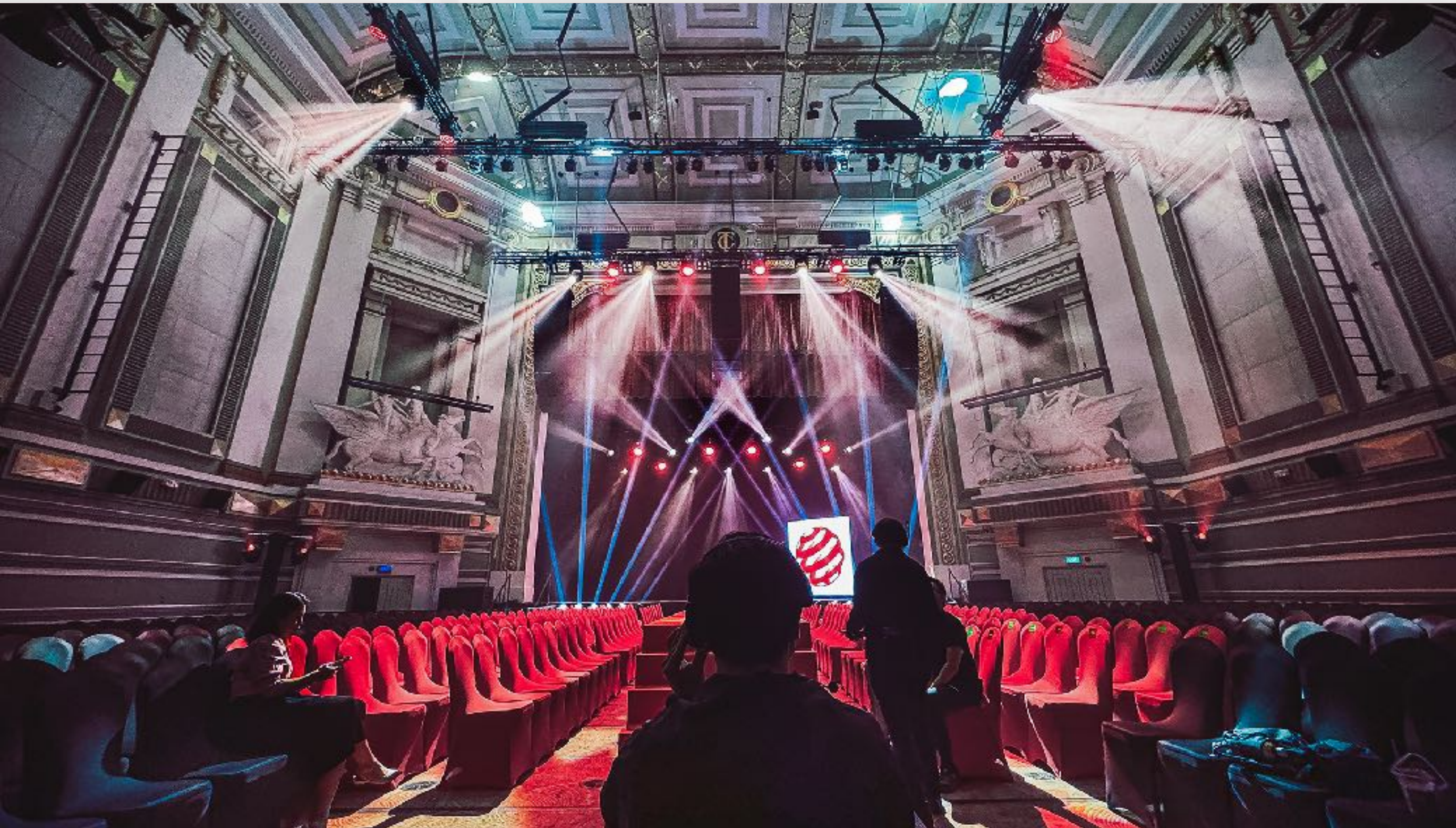
Click to shuffle through images