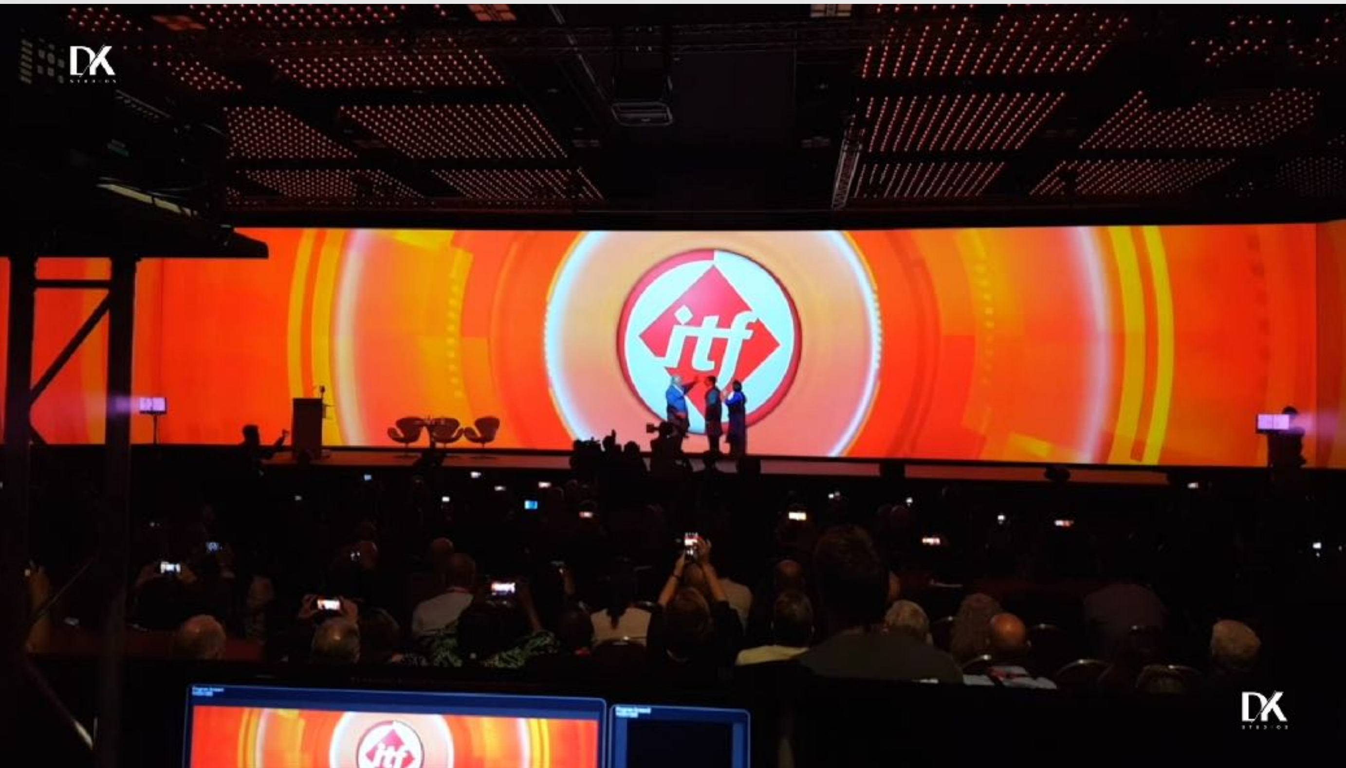
Click to shuffle through images