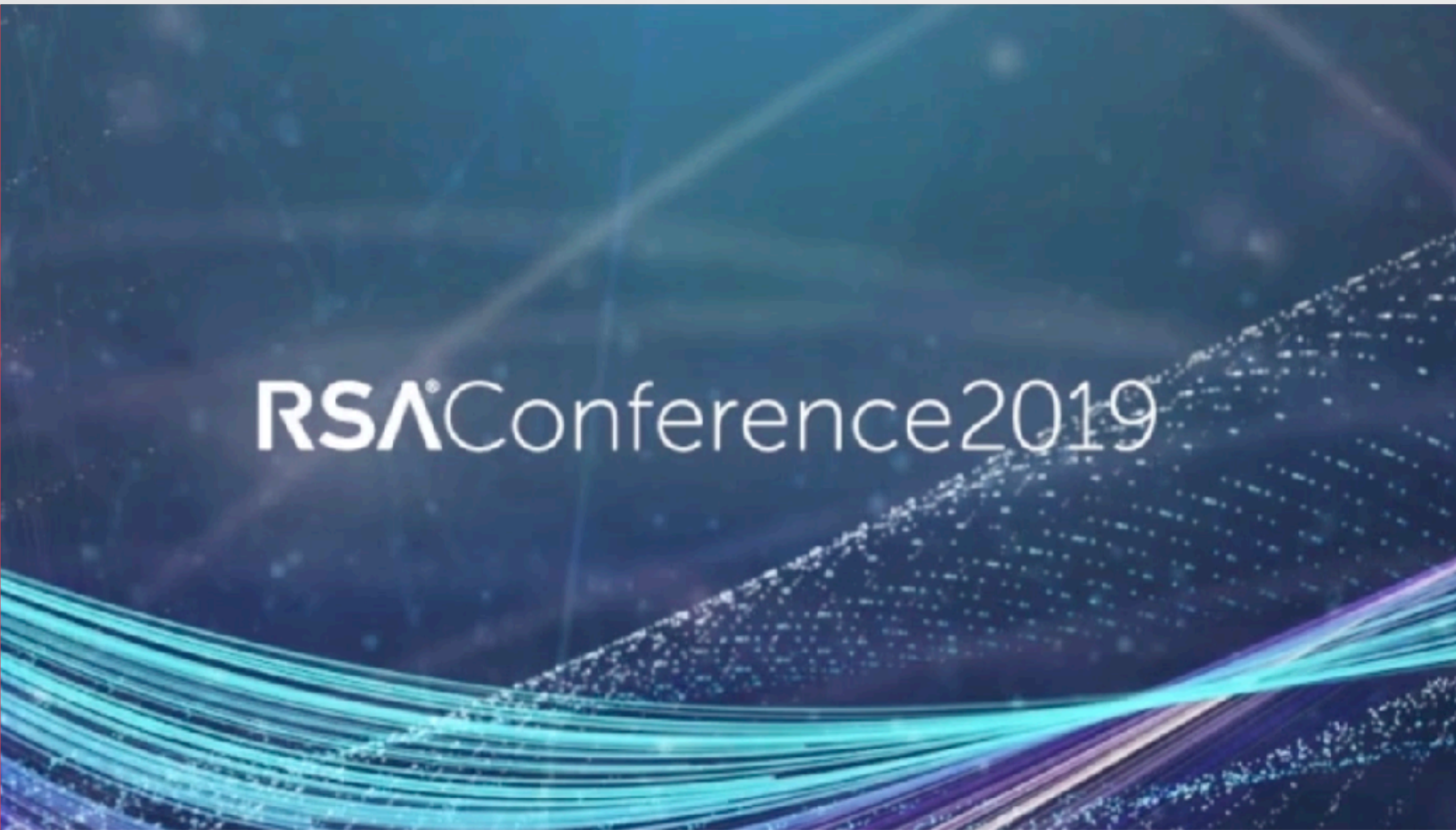
Click to shuffle through images