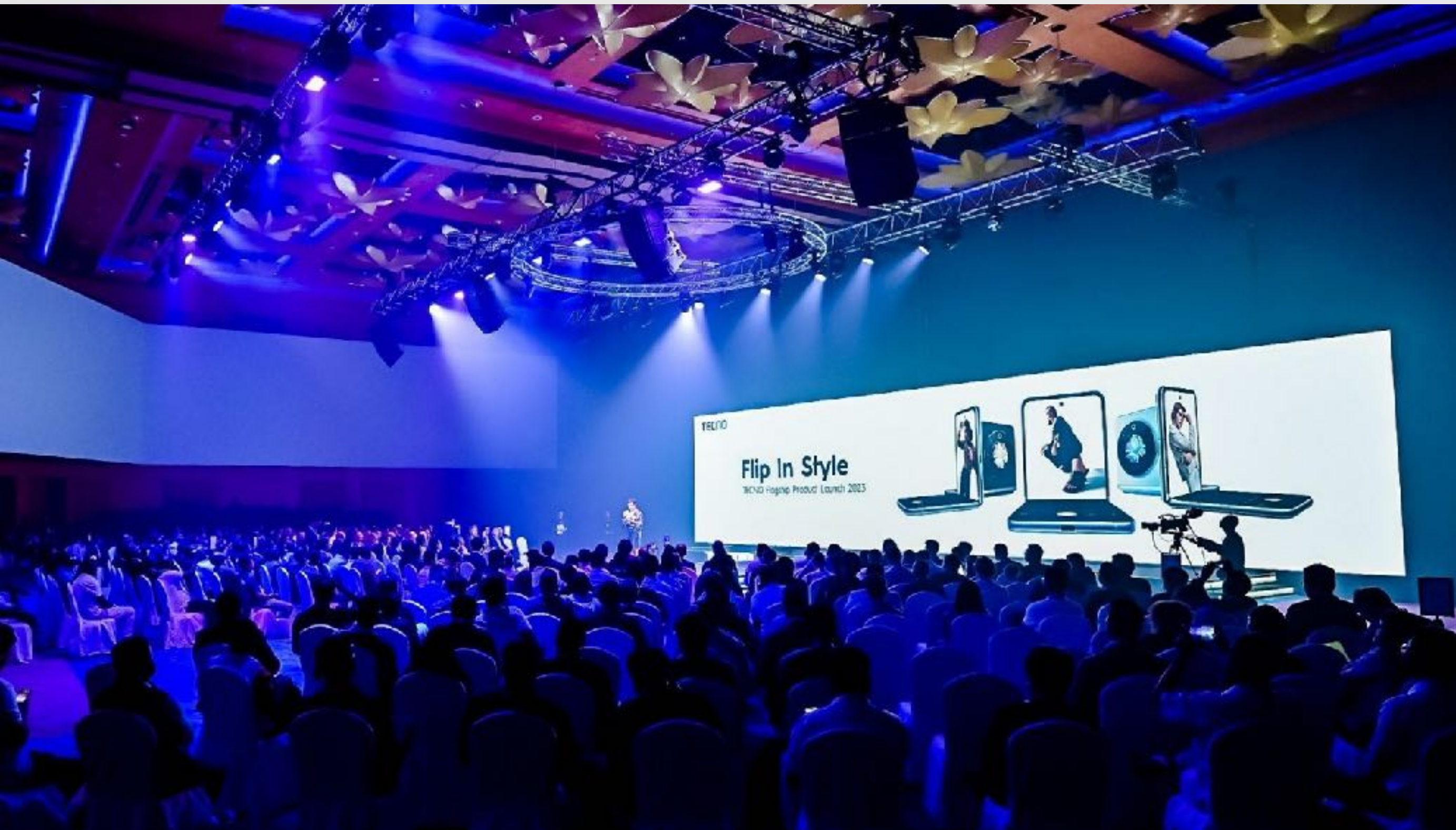
Click to shuffle through images