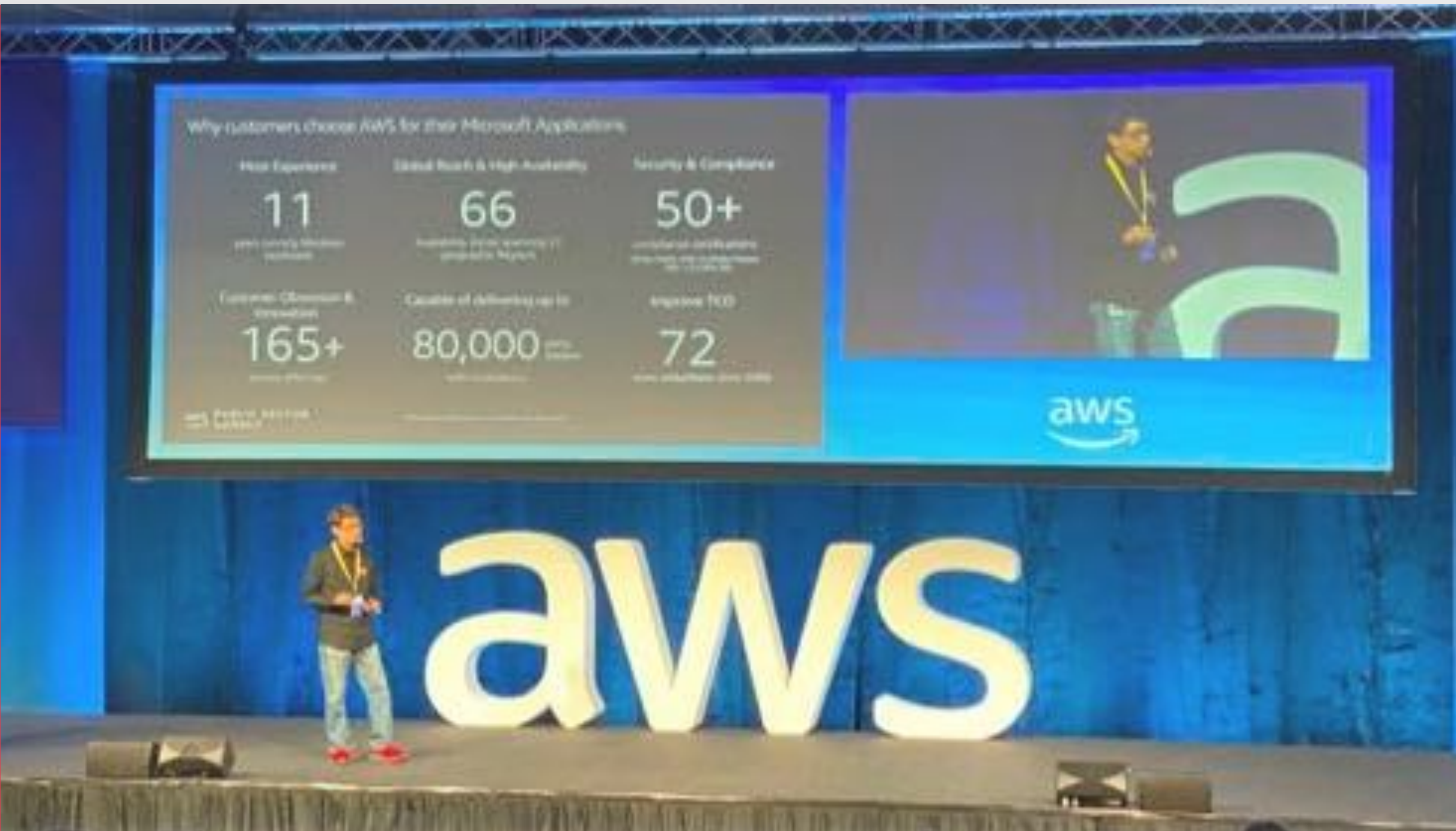
Click to shuffle through images