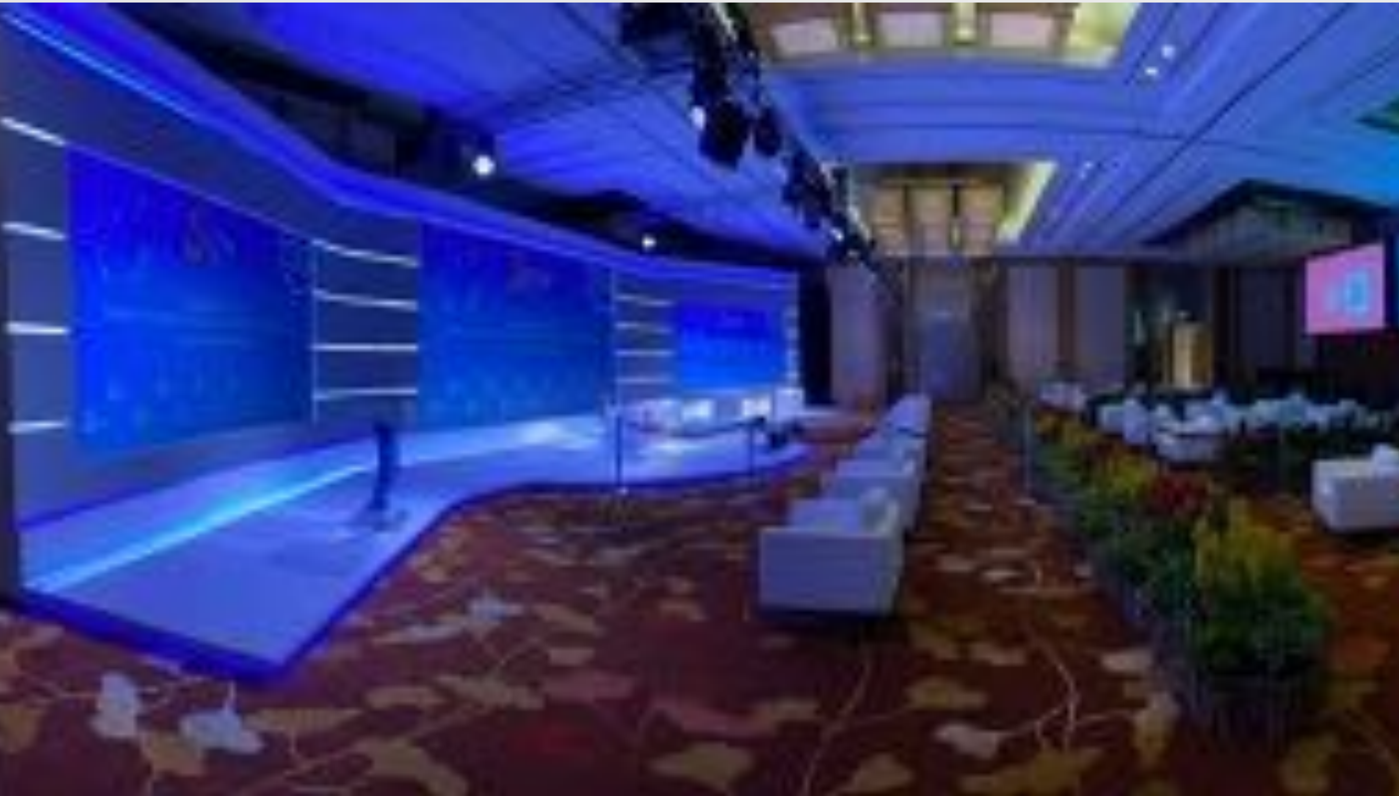
Click to shuffle through images