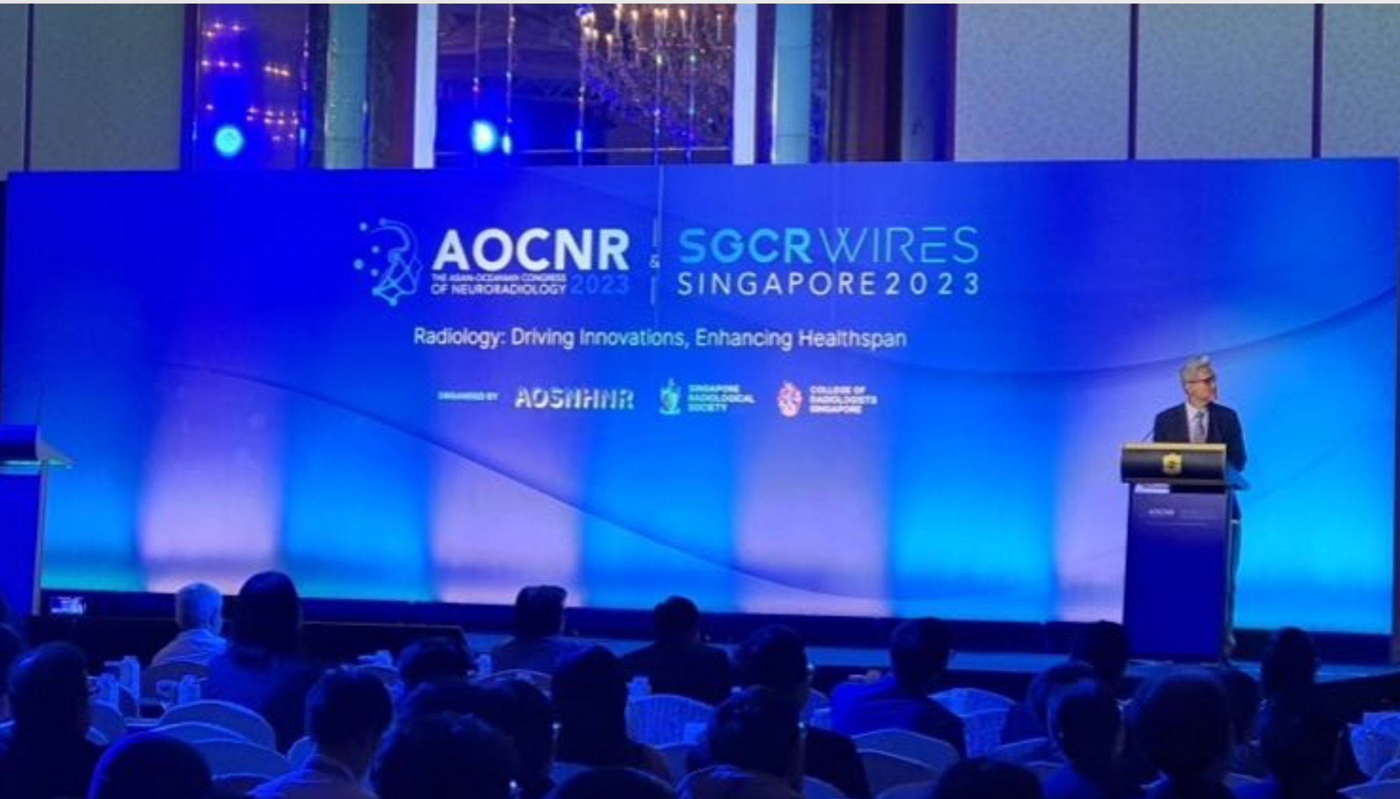
Click to shuffle through images