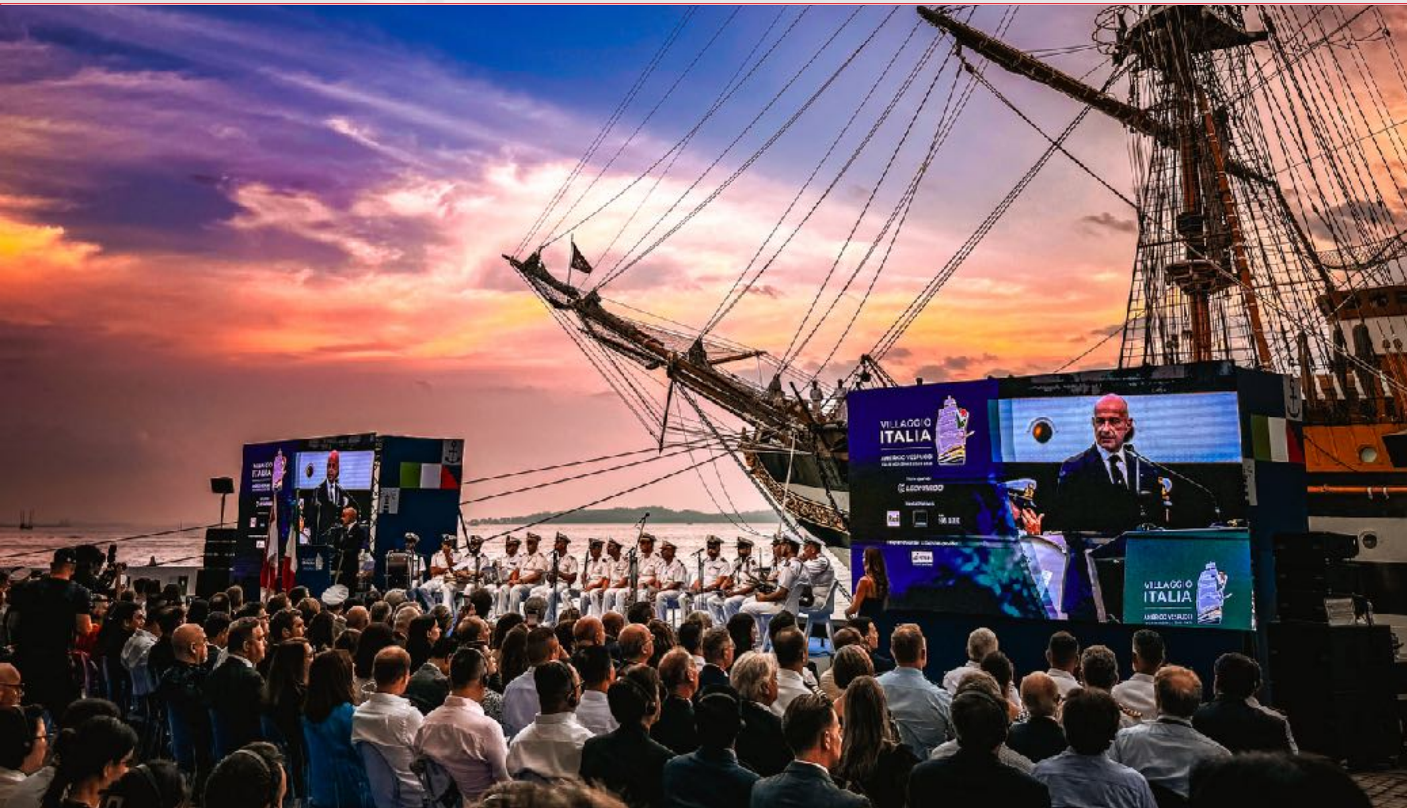
Click to shuffle through images