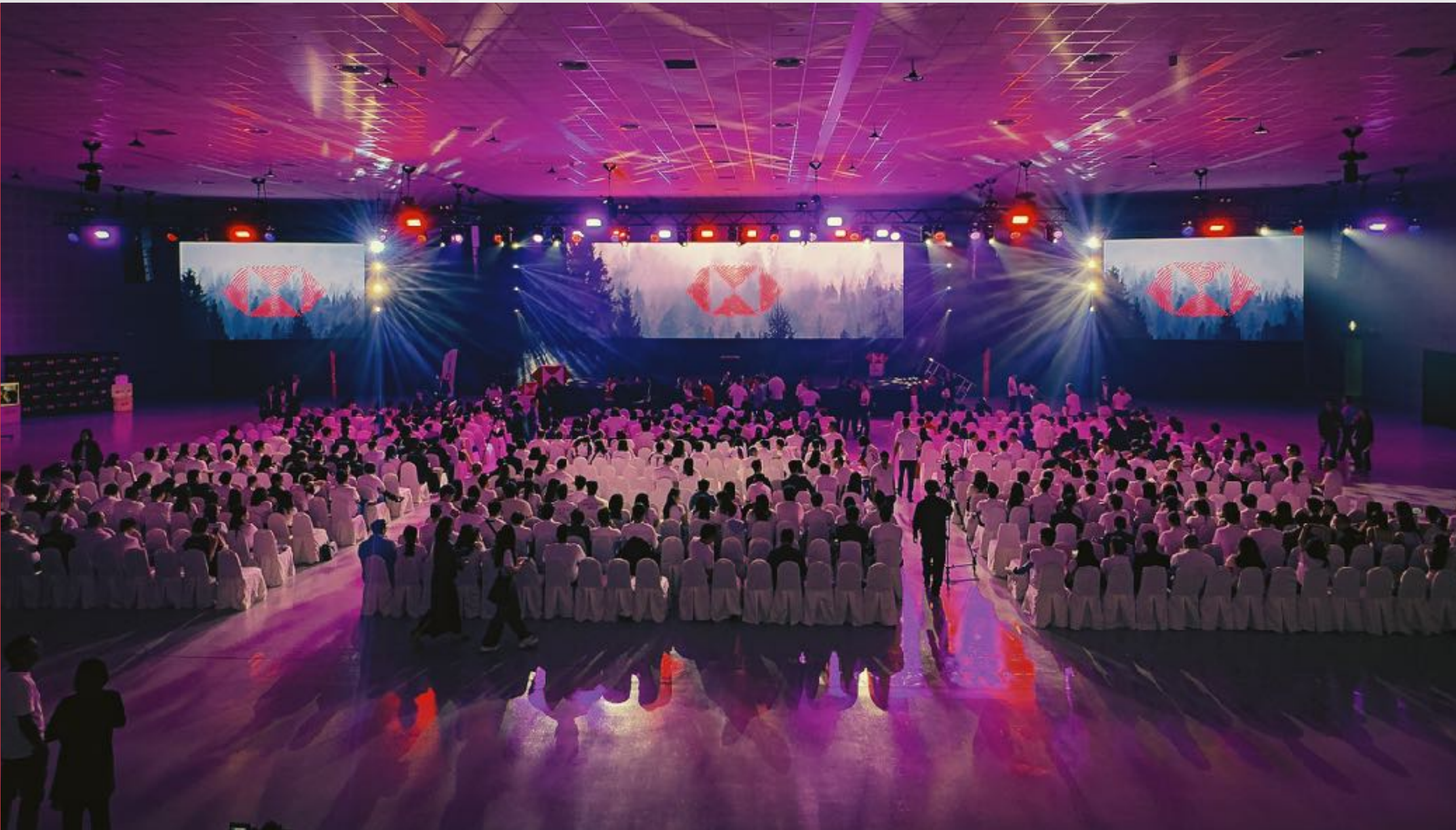
Click to shuffle through images