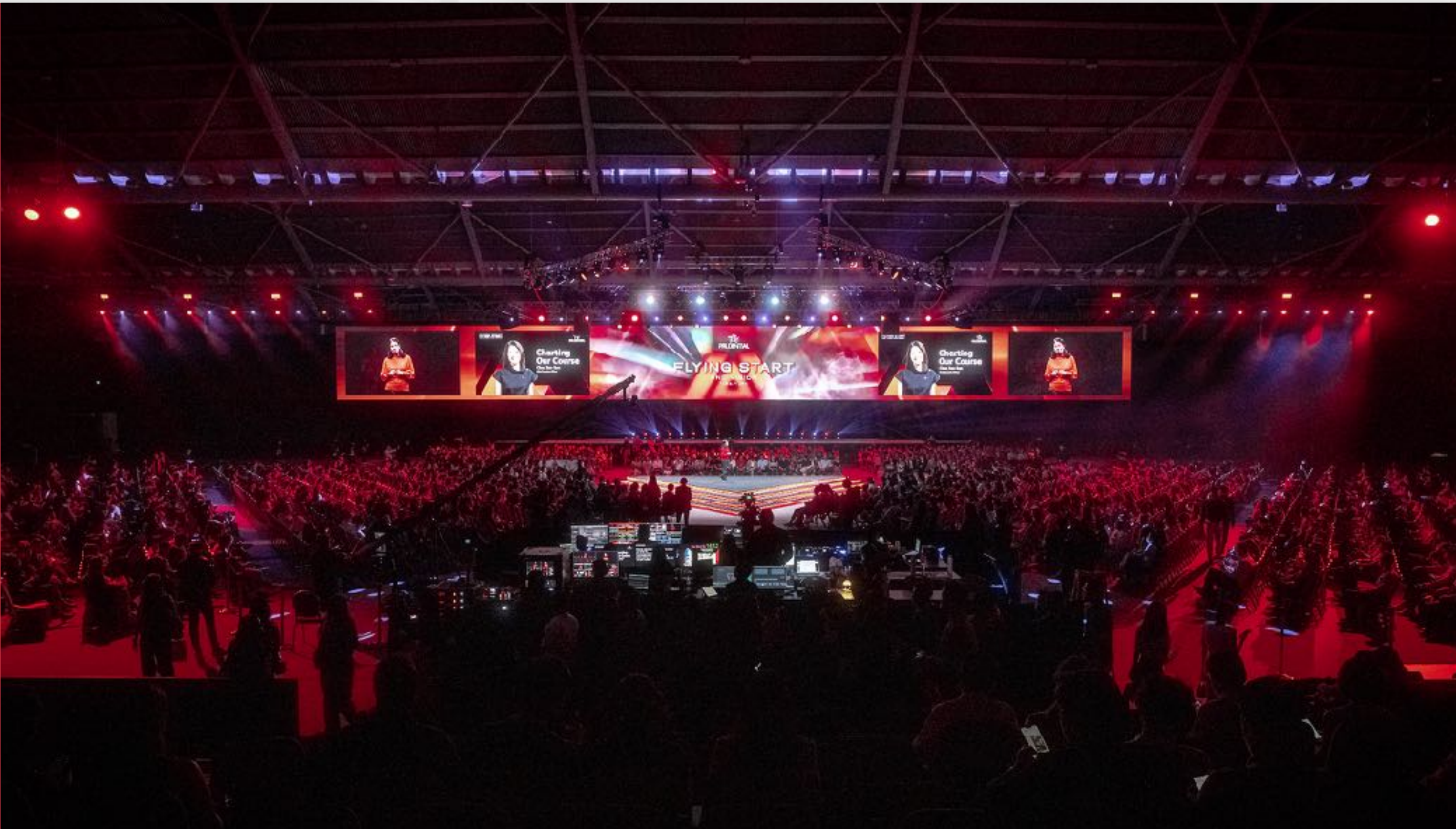
Click to shuffle through images