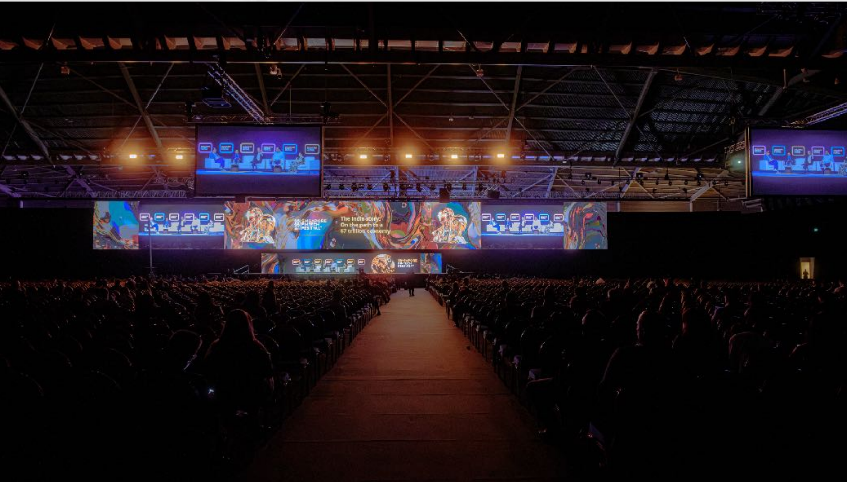
Click to shuffle through images