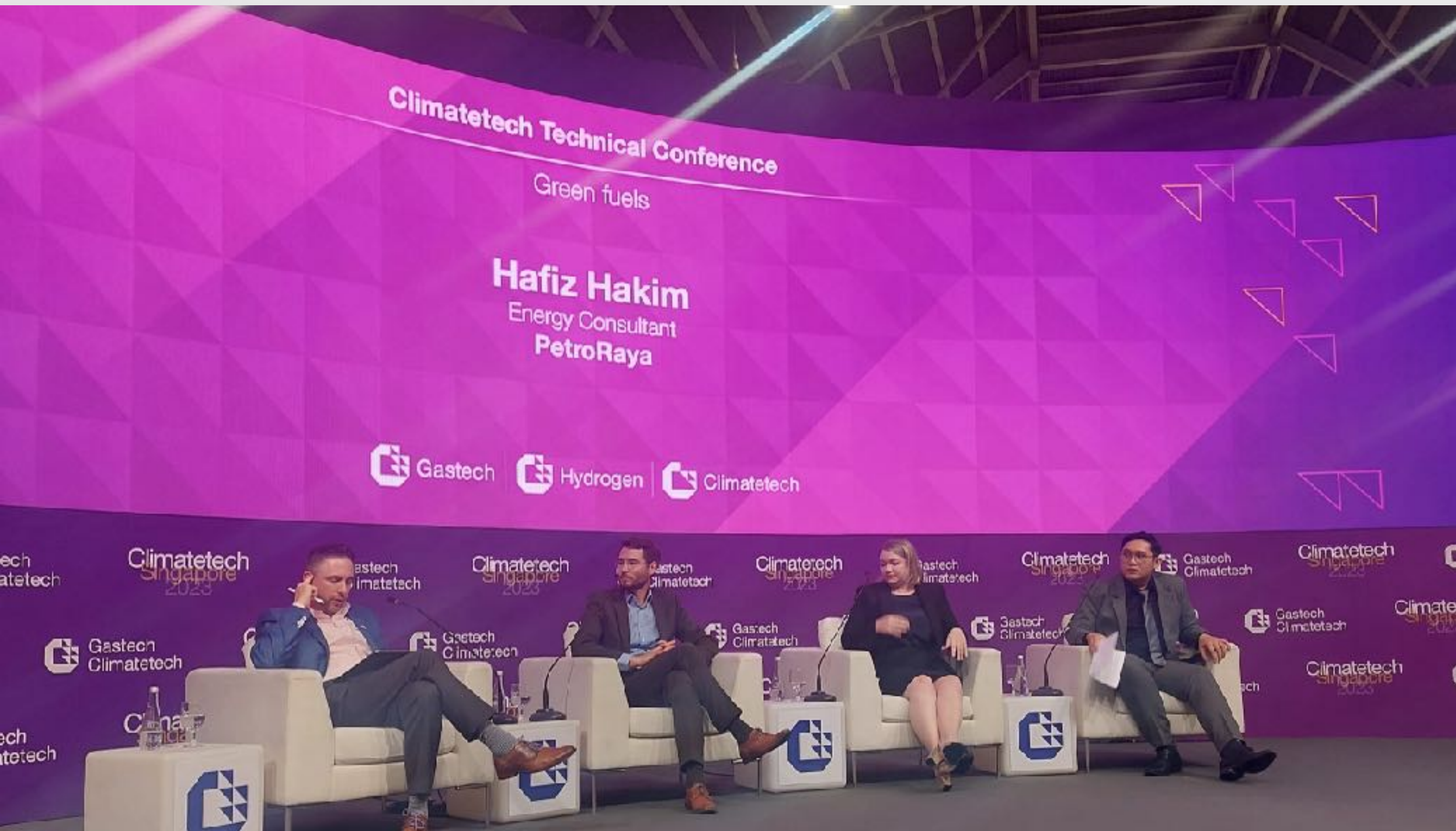
Click to shuffle through images