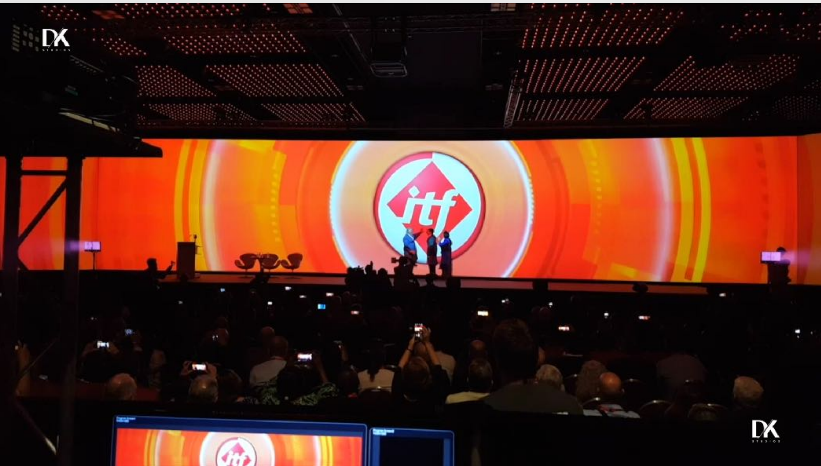
Click to shuffle through images

The 44th ITF Congress, held in 2018 at Suntec Singapore, brought together over 2,000 delegates from 140 countries, representing 600 transport unions and 19 million members. As the first ITF Congress in Southeast Asia, it set a five-year agenda for the transport industry, focusing on digitisation, innovative campaigns, union growth, and policies to ensure equitable, sustainable jobs. Guest-of-honour Mr. Ng Chee Meng, NTUC Secretary-General and Minister in the Prime Minister's Office, emphasised the importance of partnerships for sustainable job creation.