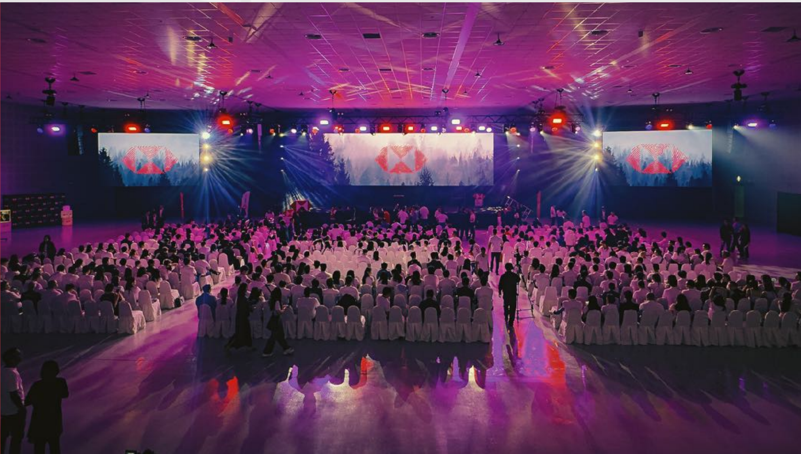
Click to shuffle through images

Expo AV, in partnership with NTUC Club and Downtown East’s D’Marquee, brought HSBC Life’s “Flying Start 2025” to life with professional AVL solutions. High-resolution LED walls, seamless live streaming, crystal-clear audio, and dynamic lighting transformed D’Marquee into an engaging and immersive event space. This seamless collaboration showcased how innovation and expertise can elevate events, leaving a lasting impact and setting a benchmark for excellence.